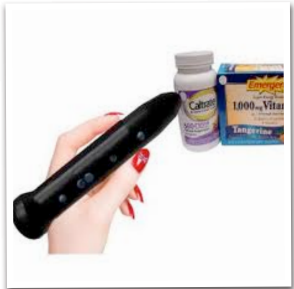
The 'pen friend' in action.

see that there are plenty of places where the 'bubble' is still over your spot. If retinal surgery is to fix a tear rather than a macula hole then the patient would need to lie in a position opposite to the tear. Having a visual explanation made this very